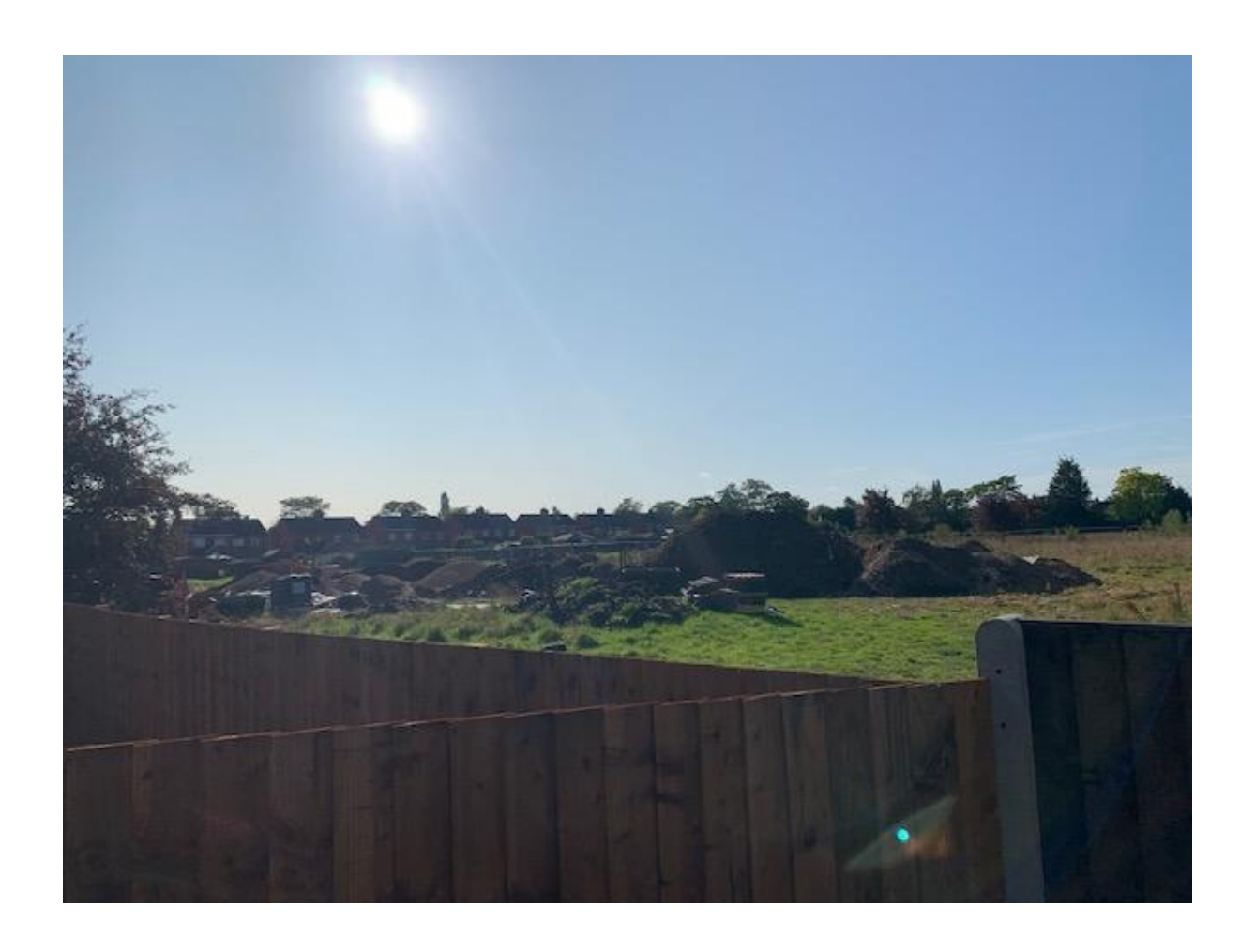
Photo to show Phase 4, with existing dwellings at St. Helen's Avenue beyond.