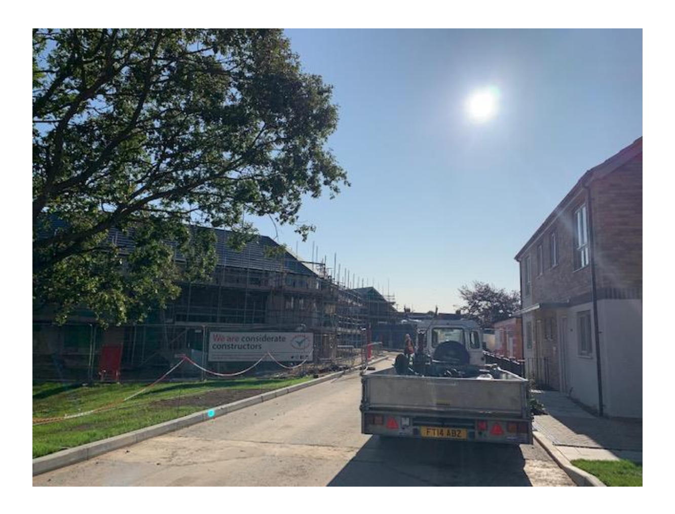
Photo to show construction work currently being undertaken at Phase 3