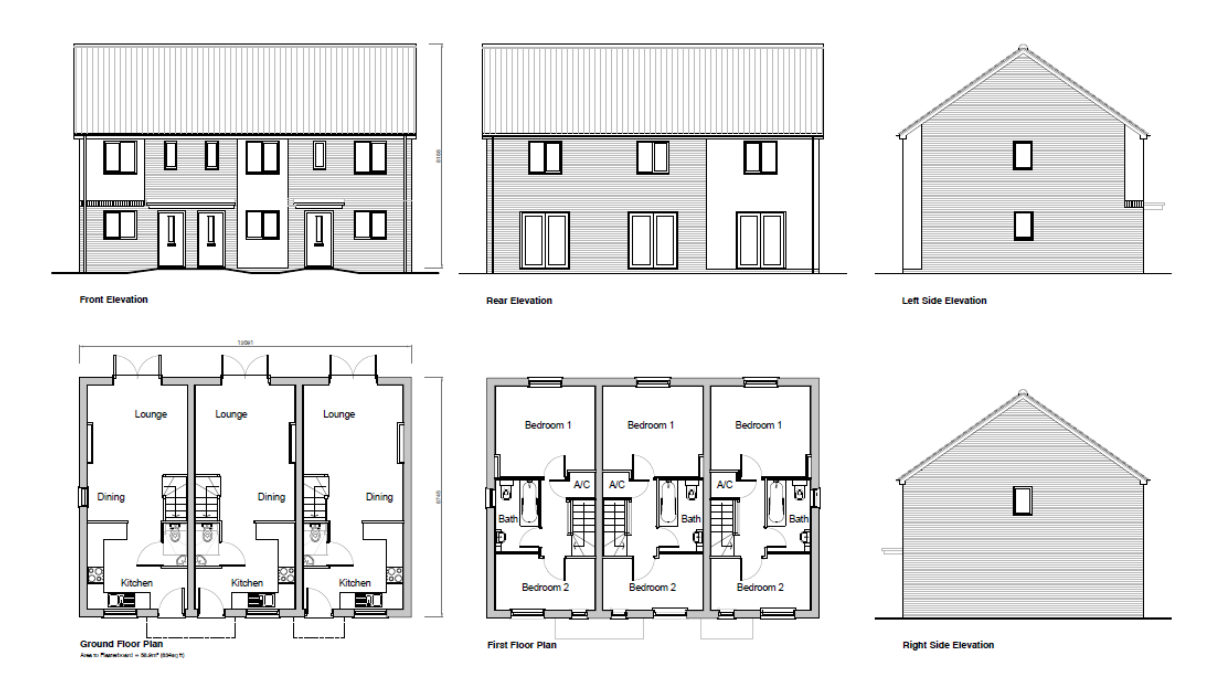
Type 3N-3Block Floor Plans & Elevations Plots 75, 75a & 76