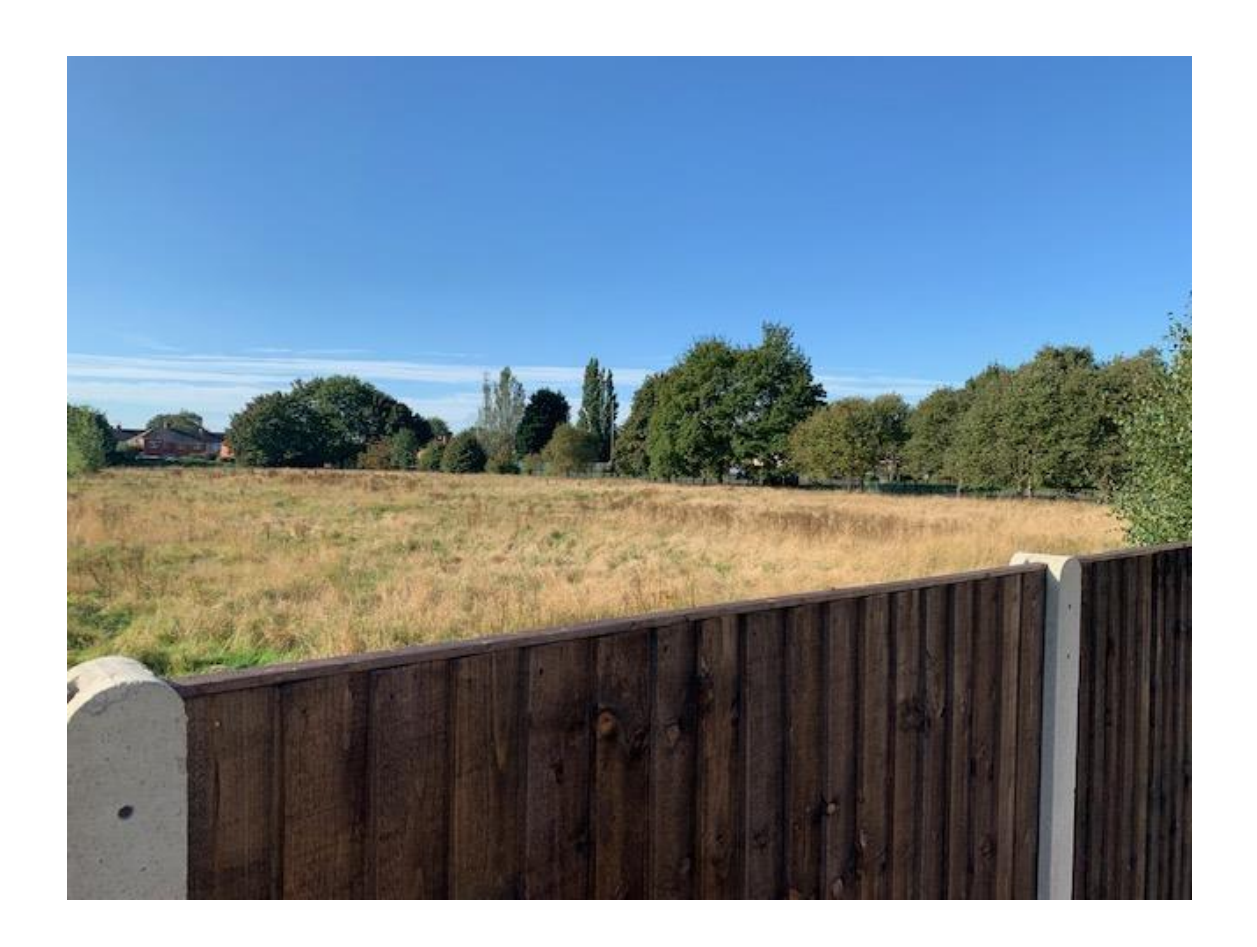
Photo to show the remaining area of land at the former school site, which is located immediate to the west of Phase 4 and East of Tritton Road. This area does not form part of the application site.