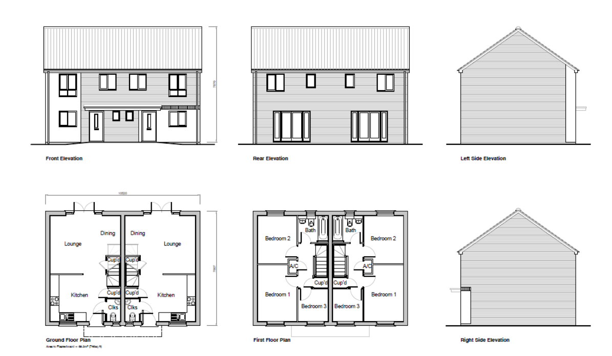
Type 1G Floor Plans & Elevations Plots 65, 66, 75, 76, 78, 79 Deg No. 10-Harning-01 RevA Scale 1-100 g/A3 March 2018